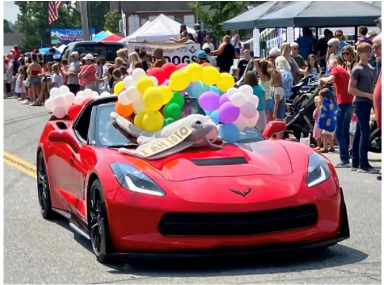
Gee... Who could it be in the balloon-covered car?