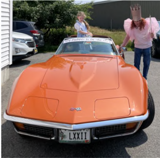
Glinda's bubble was in the shop.