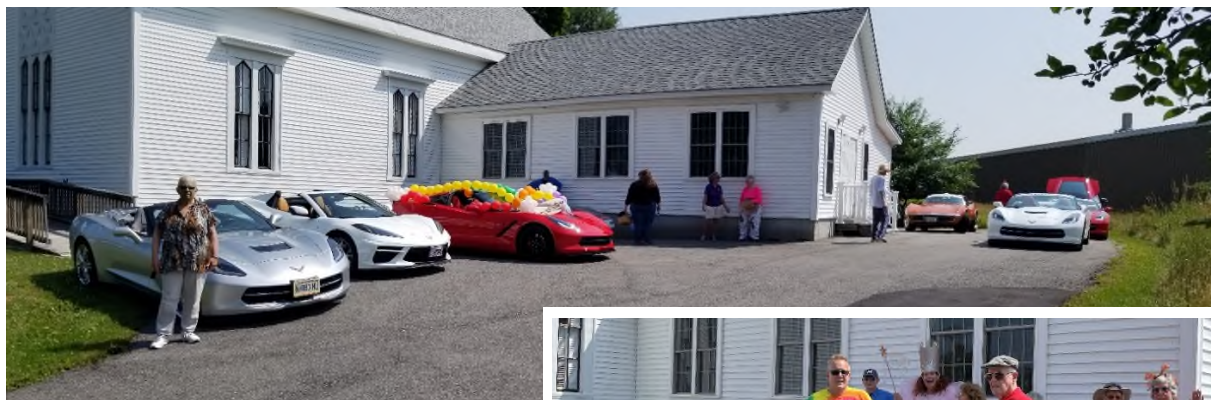
Waiting for the parade to begin.